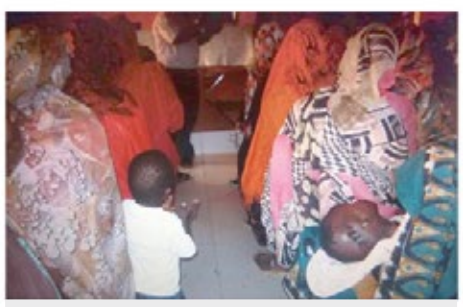
Christian women, imprisoned under sharia law, worshipping with their children in jail. Barnabas supports a prison ministry that helps them both practically and spiritually

A genocidal jihad waged for over 35 years in the Nuba Mountains, Sudan's oldest Christian region, continues. Christians in this border region with South Sudan suffer aerial bombing (diminishing since 2017), forced conversion, systematic mass rape, jailing of Christian leaders, with many tortured and killed. More than 500,000 died in the 1990s. Deliberate starvation is imposed through a humanitarian aid blockade – aid from the north cannot be trusted and the UN will not enter the disputed territory.