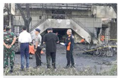
The entrance to one of three churches targeted by Islamic bombers on the island of Java in May 2018

Pastors report that churches are increasingly being closed. In August 2019, police forcibly shut a church building in Sumatra and even stopped the congregation from continuing to worship in a tent.