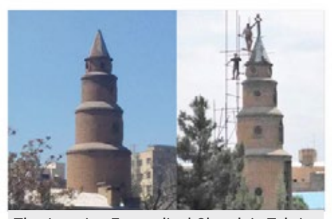
The Assyrian Evangelical Church in Tabriz, left, after the authorities tore down its cross, and with its cross restored, right

Muslim-background Christians are often charged with "acting against national security" and given long prison sentences. The government seems to have a strategy of getting new converts to leave the country voluntarily, by arresting them and releasing them again soon afterwards, sometimes even openly suggesting that the converts leave. Because so many do leave, it means that most leaders of convert groups have little theological and Biblical education.