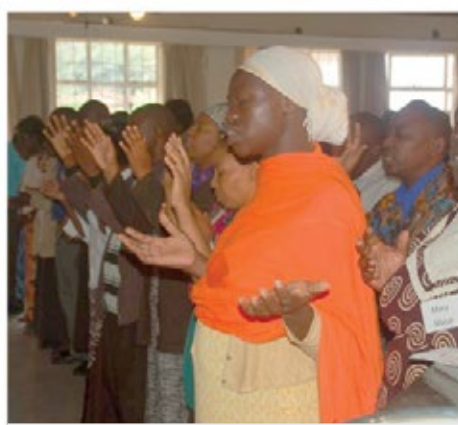
Kenyan Christians are frequently targeted by Al Shabaab

In 2016, Kenya introduced strict new regulations for religious societies, including the requirement for church leaders to have a theology certificate from a certified institution. Some leaders raised concerns that the rules seemed to be aimed at restricting the Church in Kenya.