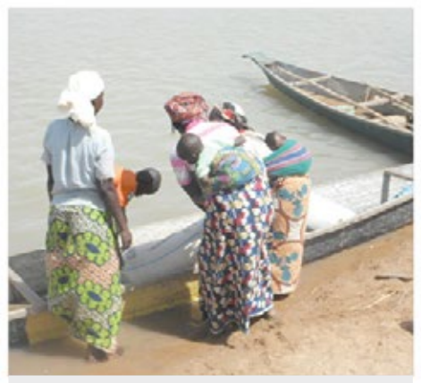
Christian women living in the Lake Chad area receiving food aid from Barnabas

Christians also face persecution from followers of traditional African religions. Animists account for around one-fifth of the population. In 2018, a "Yondo" initiation year, hundreds of young Christian men and boys fled from their villages to avoid being abducted to undergo brutal, and sometimes fatal, initiation rites.