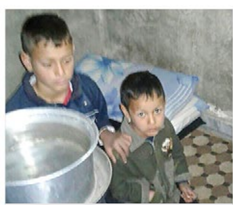
Christian children in Syria, many terribly traumatised during the war, are suffering great hardship

Tens of thousands of Christians were among the more than five million refugees who fled since the conflict began. Many of them have been facing discrimination and sometimes violence in the countries where they fled, while those who manage to reach Europe are at risk of being attacked in Muslimdominated refugee shelters and often find it difficult to claim asylum.