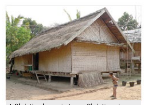
A Christian home in Laos. Christians in rural areas are particularly subject to persecution by local authorities

Laos is one of the poorest countries in south-east Asia. Around 80% of the seven million population, which is mainly Buddhist, work in agriculture.