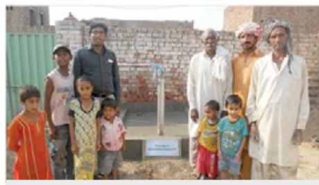
Indian Christians with a well supplied by Barnabas Fund

It is becoming increasing difficult for Christian organisations to receive financial donations. Christian and Muslim Dalits suffer more discrimination than Indian-origin Dalits and are excluded from the Dalit education and employment quotas.