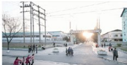
In the early twentieth century Pyongyang, now the capital of North Korea, was called “the Jerusalem of the East” because it had so many church buildings

Every year, thousands attempt to escape to China or South Korea. The Chinese government is thought to conspire with the North Korean authorities to forcibly repatriate those who manage to cross the border. According to an official who defected, escapees are tortured until they reveal where they have been and who they have contacted. Any suspected of being Christian are especially targeted.