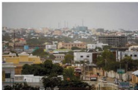
Mogadishu, capital of Somalia

Somalia has been ravaged by conflict since 1991, when rival warlords began fighting for control. In 2006, an Islamic coalition with Al Shabaab as its military wing briefly seized Mogadishu, and most of southern and central Somalia. Despite international efforts, spearheaded by the African Union, to defeat Al Shabaab, it still holds swathes of territory. Allied with Al Qaeda, it aims to establish a caliphate in Somalia and neighboring regions, such as north-east Kenya. The group has carried out numerous attacks in Kenya, and on its Christian residents, since 2011 when the Kenyan government sent troops into Somalia to counter terrorist activity.