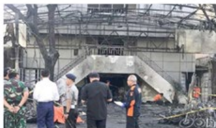
The entrance to one of three churches targeted by Islamic bombers on the island of Java in May 2018

Pastors report that churches are increasingly being closed. In August 2019, police forcibly shut a church building in Sumatra and even stopped the congregation from continuing to worship in a tent.