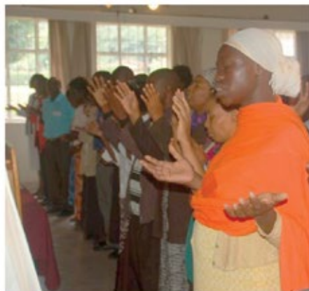
Kenyan Christians are frequently targeted by Al Shabaab

In 2016, Kenya introduced strict new regulations for religious societies, including the requirement for church leaders to have a theology certificate from a certified institution. Some leaders raised concerns that the rules seemed to be aimed at restricting the Church in Kenya.