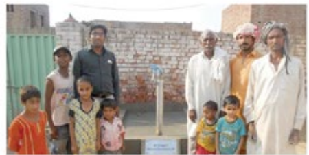
Indian Christians with a well supplied by Barnabas Aid

It is becoming increasingly difficult for Christian organizations to receive financial donations. Christian and Muslim Dalits suffer more discrimination than Indian-origin Dalits and are excluded from the Dalit education and employment quotas.