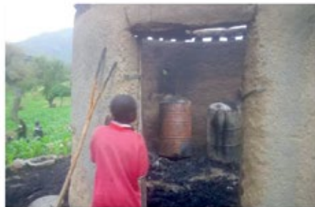
Boy returns to a burnt-out home in a Christian village attacked by Boko Haram in Far North Cameroon

Throughout the rainy season in 2019, communities were unable to farm because of relentless Boko Haram violence. A local pastor told Barnabas, “The lack of a harvest will cause long-term hardship for our Christian brothers and sisters.”