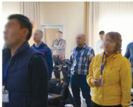
Christian converts from Islam attend a Barnabas supported training seminar

In Kyrgyz culture there is great concern about what happens to the body after death; converts fear being given Muslim funerals because there is only one cemetery for Christians in the whole country.