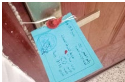
An official seal on a door of one of at least 11 churches closed in Algeria since early 2018

Algeria experienced political upheaval in 2019 when 82-year-old President Abdelaziz Bouteflika resigned in April, after 20 years in office, raising concerns of a power-grab by Al Qaeda. After a series of postponed elections, Bouteflika’s successor, Abdelmadjid Tebboune, the former acting head of state, was elected in December 2019.