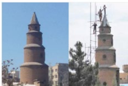
The Assyrian Evangelical Church in Tabriz, left, after the authorities tore down its cross, and with its cross restored, right

Muslim-background Christians are often charged with “acting against national security” and given long prison sentences. The government seems to have a strategy of getting new converts to leave the country voluntarily, by arresting them and releasing them again soon afterwards, sometimes even openly suggesting that the converts leave. Because so many do leave, it means that most leaders of convert groups have little theological and Biblical education.