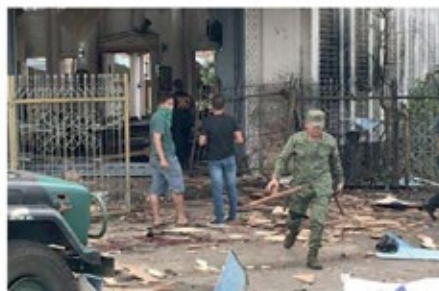
Scene of destruction outside Jolo cathedral after Islamist extremists detonated two bombs during a Sunday service in 2019.