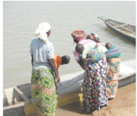
Christian women living in the Lake Chad area receiving food aid from Barnabas

Christians also face persecution from followers of traditional African religions. Animists account for around one-fifth of the population. In 2018, a “Yondo” initiation year, hundreds of young Christian men and boys fled from their villages to avoid being abducted to undergo brutal, and sometimes fatal, initiation rites.