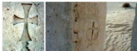
Ruins of a church building, dating from the fourth century, were discovered in Saudi Arabia in the 1980s.

Saudi Arabia propagates its strict Wahhabi interpretation of Islam worldwide. Organizations such as the Organization of Islamic Cooperation (OIC), Islamic charities and dawa (Islamic mission) networks funnel oil money into dawa projects across the world. This has included school textbooks that encourage jihad as a means of spreading Islam and present Christians and Jews as enemies. Saudi Arabia is known to have provided financial support to jihadi groups operating in other nations including Syria and Myanmar.