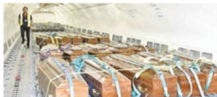
The bodies of the 20 Egyptian Christians, martyred in 2015 by Islamic State in Libya, were flown back to Cairo on May 14, 2018. A Ghanaian Christian was also murdered with them

Late in 2019, Turkish and Syrian militias were deployed to support the GNA. A ceasefire was agreed during peace negotiations in Germany on January 16, 2020. A few days later, countries with an interest in Libya, including Russia, France and Turkey, agreed to an arms embargo provided the ceasefire holds.