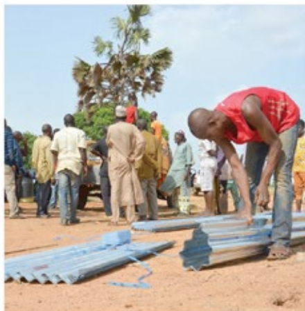
Barnabas Aid is enabling the victims in Kajuru village, Nigeria to repair their homes

Nigeria is roughly 50% Muslim and 50% Christian. The majority of Muslims live in the north and the south is mainly Christian, while the Middle Belt is more diverse. Becoming independent from the UK in 1960, it has a secular constitution, but twelve northern states instituted elements of sharia law between 1999 and 2001.