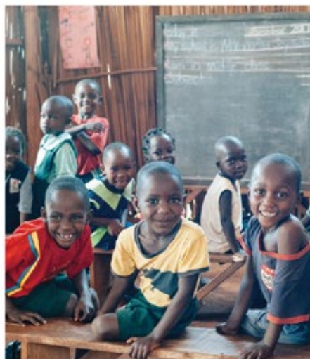
South Sudanese refugee schoolchildren in Camp Rhino, Uganda

As we stand together with our persecuted brothers and sisters, we can look ahead to the moment when, in the words of John Newton’s hymn, “grace will lead us home” – home into the welcoming arms of our loving Savior.