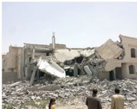
Much of Yemen lies in ruins after years of civil war

Christianity was established in Yemen in 354 AD when the Roman ambassador converted the country's pagan king. Yemeni Christians suffered severe persecution, from Jews and Muslims. The Islamic Caliph Umar (634-644 AD) decreed that all Jews and Christians should be expelled from the Arabian peninsula.