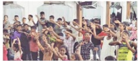
Children enjoying Sunday school at Zion Church, Batticaloa on Easter morning, moments before a bomb exploded killing at least 30 people, including 14 children

Radical Muslims are also pressurizing, sometimes violently, both Christian and Hindu ethnic Tamils in the east of the country to convert to Islam. At least ten Tamil villages are now 100% Muslim and have new Arab names. Hindus make up 14% of Sri Lanka's population. The three-decade civil war, which ended in 2009, is still a bitter memory for the defeated Tamils, not least because they are oppressed and disadvantaged in many ways by the Sinhala-dominated authorities.