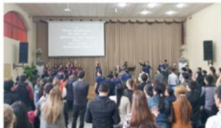
Evangelical churches are growing in Uzbekistan

Christianity in Uzbekistan was nearly eradicated under the Turkic military leader Tamerlane (1336-1405). Known for his hatred of Christians, he is still celebrated as a hero by Uzbeks. Tamerlane made his capital in the city of Samarkand, using wealth from his conquests to construct grand mosques.