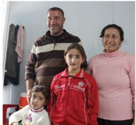
Iraqi refugee family who were forced to flee from their homes

It is estimated that around 75% of Iraq's Christian population (around 1.5 million believers in 1990) have left the country due to anti-Christian hostility and violence which began after the 1990-91 Gulf War and intensified after the fall of Saddam Hussein's regime in 2003. Such violence included murders, kidnappings and attacks on church buildings and Christian-owned businesses.