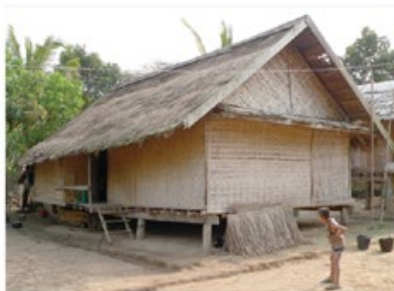
A Christian home in Laos. Christians in rural areas are particularly subject to persecution by local authorities

Laos is one of the poorest countries in south-east Asia. Around 80% of the seven million population, which is mainly Buddhist, work in agriculture.