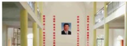
A portrait of China’s President Xi Jinping has replaced Biblical paintings in a church in Jiangxi

The Chinese government is rolling out an artificial intelligence (AI) surveillance system across the country using advanced facial recognition to track the movements of its citizens. In Beijing and Shanghai, pilot schemes of “social scoring” watch for “dissent” from prescribed communist doctrines in people’s visible behavior or online activities. The authorities have already used technological advances against minority Uighur Muslims and Tibetan Buddhists, and Christians can expect the technology will be turned against them.