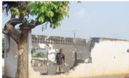
Christian communities continue to be targets in the violence that has wracked CAR since Seleka military forces held political power in 2013-2014

Despite the 2017 ceasefire agreement, and the continued presence of UN and other peacekeeping forces, the country remains susceptible to outbreaks of violence. This is mostly between the Seleka and the “anti-balaka” militia – who misleadingly call themselves Christians, despite their actions being condemned by church leaders.