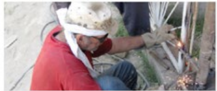
Turkmen Christian at work

Christianity in the region dates back to the third century. About 9% of the population are Russian Orthodox Christians and there is a small, growing community of Muslim-background converts. Ethnic Turkmens account for around 80% of the population and Turkmen identity is bound up with Islam, with Christianity viewed as associated with negative foreign influences.