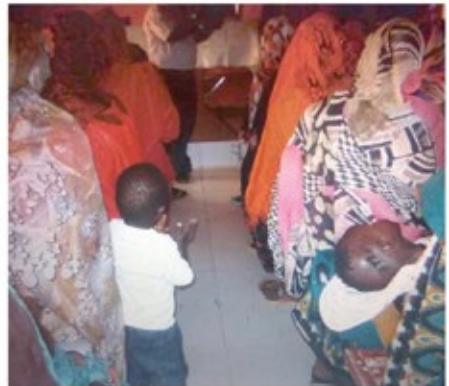
Christian women, imprisoned under sharia law, worshipping with their children in jail. Barnabas supports a prison ministry that helps them both practically and spiritually

A genocidal jihad waged for over 35 years in the Nuba Mountains, Sudan's oldest Christian region, continues. Christians in this border region with South Sudan suffer aerial bombing (diminishing since 2017), forced conversion, systematic mass rape, jailing of Christian leaders, with many tortured and killed. More than 500,000 died in the 1990s. Deliberate starvation is imposed through a humanitarian aid blockade – aid from the north cannot be trusted and the UN will not enter the disputed territory.