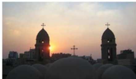
The number of churches granted licences in Egypt rose steadily throughout 2019

Christianity is deeply embedded in Egypt's history, dating back to the first century AD. Despite the later arrival of Islam and centuries of persecution, Christians number about 10% of the population.