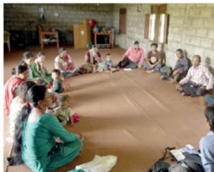
One of the Barnabas-sponsored Bible study classes in Nepal that led to the training of 213 tutors and helped to train 6,094 students in the year up to July 2019

In April 2019, four Christians involved in running training courses for pastors at a church in Dang district, mid-western Nepal, were arrested for trying to “lure conversions”. Police claimed that cash and a nebulizer, a device that aids breathing, found in their hotel room proved they were using “enticements”. After a court hearing in Nepal, the four accused – two Nepali men, an Indian national and a US woman – were released, in a victory celebrated by local Christians.