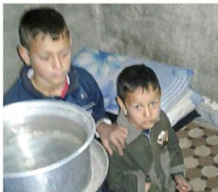
Christian children in Syria, many terribly traumatized during the war, are suffering great hardship

Tens of thousands of Christians were among the more than five million refugees who fled since the conflict began. Many of them have been facing discrimination and sometimes violence in the countries where they fled, while those who manage to reach Europe are at risk of being attacked in Muslim-dominated refugee shelters and often find it difficult to claim asylum.