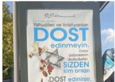
Chilling posters warning against befriending Christians or Jews were put up by a radical Islamist group

In October 2019, Turkish military forces were accused of carrying out a "soft ethnic cleansing" of Christians by terrorizing them into fleeing, in an offensive in north-east Syria. This was despite assurances from President Erdogan that his army would not persecute religious minorities.