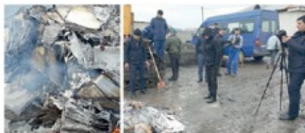
Authorities in Tajikistan film their burning of 5,000 calendars sent to registered evangelical churches

Because of the dire economic situation, tens of thousands of ethnic Russian and European Christians have left Tajikistan to seek work in Russia, including many pastors. So too have converts from Islam, who often lose their jobs when they decide to follow Christ. The declining numbers make life harder for remaining Christians.