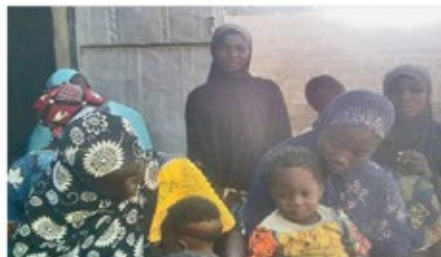
Christian women and children who survived an extremist attack on a church that killed 14 of the 15 males in the congregation

The politically unstable country has experienced a number of military coups. With a mainly subsistence economy, Burkina Faso is one of the poorest countries in Africa, despite its gold reserves. Two-fifths of the population are younger than 15 and life expectancy is low.