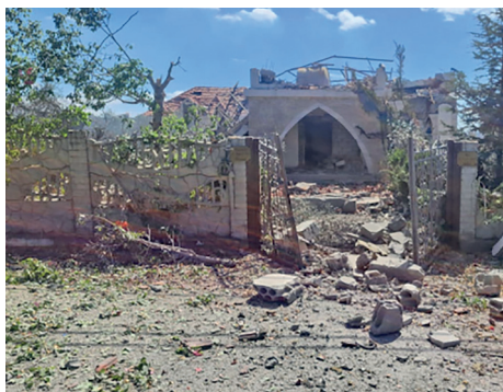
A house in a southern Lebanese Christian village. Many have fled the conflict, but others remain to try to protect their historic lands

Lift up our brothers and sisters in Lebanon to the Lord. Pray that He will direct their steps (Proverbs 16:9), whether to move to safer areas or remain. Pray for the safe arrival of aid, especially to areas most affected by the conflict. Pray that the conflict will not interfere with the supply of blankets, warm clothes and fuel as winter closes in and temperatures fall.