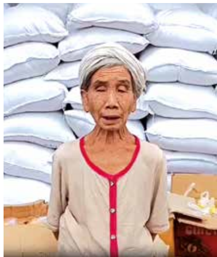
An elderly Christian thanks Barnabas for sustaining 350 families with food aid.

THURSDAY 26 The Myanmar military (Tatmadaw) continues to attack Christian areas. Local human rights advocates have reported that the Tatmadaw has destroyed or damaged 75 Christian churches in Chin State alone since the coup in February, 2021. Christians have been forced to flee their homes and find shelter in IDP (Internally Displaced Persons) camps, but even these camps have come under attack and many believers have had to seek refuge in the jungle. Pray for protection for Christians in Myanmar and for an end to their physically and emotionally draining ordeal. Ask the Lord to intervene for a peaceful and just resolution to the conflict.