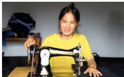
One of the South-East Asian women receiving Barnabas-funded training in sewing and weaving.

WEDNESDAY 13 "The women's sewing project really helps reduce the risk of young Christian girls being sucked into a dark world of trafficking." A Barnabas partner in South-East Asia emphasizes how vital the acquisition of such skills is. At the time of writing, 68 women are receiving training in sewing and weaving. At centers where they receive daily Christian ministry, they are equipped with sewing machines with the aim of them setting up their own businesses on completion of their training. Give thanks for the lives of young Christian women being transformed by this venture and pray for the continued success and growth of this project.