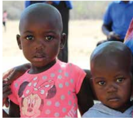
Zimbabweans are concerned about feeding their children following poor harvests.

Christian-majority Zimbabwe. “I did not harvest anything after all my effort and using all our savings to buy seeds.” Zimbabwe is one of several southern African countries suffering a worsening hunger crisis caused by drought. People there report having no food to give their children. Ask the Lord to bring an end to this crisis. Pray that He will once again provide the earth with rain (Psalm 147:8).