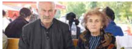
An elderly couple who were forced to flee Nagorno-Karabakh in September 2023.

FRIDAY 13 A report from the Organized Crime and Corruption Reporting Project (OCCRP) has accused the government of Azerbaijan of obstructing the work of humanitarian organizations during its nine-month blockade of Nagorno-Karabakh in 2023. Nagorno-Karabakh was home to around 120,000 Armenian Christians, who fled to Armenia in September last year when the blockade ended and Azerbaijani troops advanced into the region. The OCCRP reports that during the blockade, Azerbaijan prevented both the delivery of humanitarian aid and the evacuation of those who required medical treatment. Please continue to pray for the people of Nagorno-Karabakh, now refugees, who live with the trauma of what they have endured.