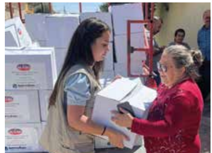
An Iraqi Christian receives a Barnabas-funded food parcel.

FRIDAY 22 Poverty, political instability and the fear of persecution are among the reasons why Christians continue to leave their ancestral homelands in Iraq. Before the US-led invasion of Iraq in 2003, there were around 1.5 million Christians in Iraq. An increase in sectarian tensions meant that only 700,000 were left by the time Islamic State (IS, ISIS, ISIL, Daesh) seized a third of the country – Christians were among those subjected to violence and displaced from their homes. In recent years it has been estimated that only 150,000-250,000 Christians are left, and this number continues to fall. Lift up in prayer our brothers and sisters who have suffered so much.